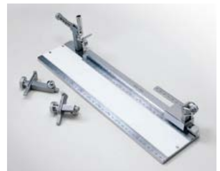
Graft Prep Station

Loop: UHMWPE Sutures: HS Fiber ® Plate: Titanium (Ti-6Al-4V)