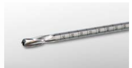
Endoscopic Reamer Ø 4.7